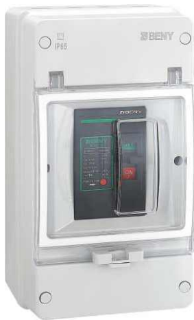
BDM-125 with IP65 Enclosure